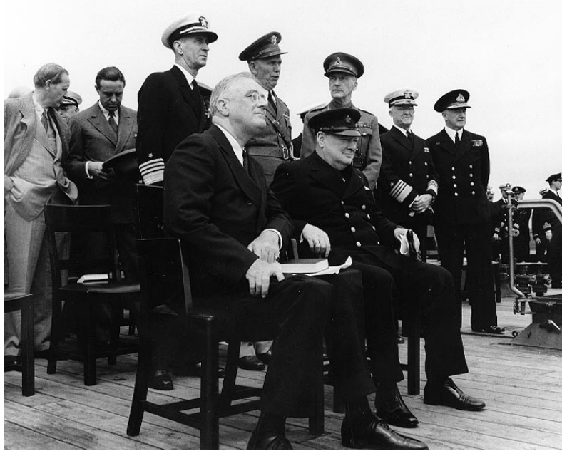
Photo # NH 67209 Leaders on board HMS Prince of Wales during Atlantic Charter conference, 1941

DEEM – VERB to consider or judge something in a particular way Soditi, meniti, misliti