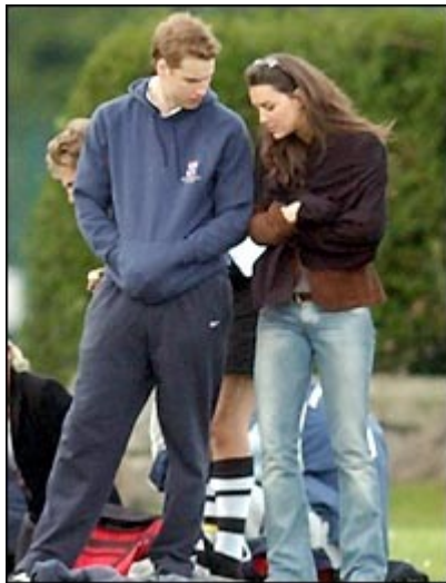
Prince William & his girlfriend Kate Middleton

For me Prince William is the most beautiful prince ever!! I think he is very intellectual, because he was visiting so many schools. First time when he went to school was when he was only 3 years old! He is very sport-loving, he was playing at least 5 sports, and I think this is very incredible for one prince. I think he wants to live normal life, but because he is the part of royal family, this can't happen. But fame is not always gut, this shows the death of his mother Princess Diana, because of that he suffered a lot.