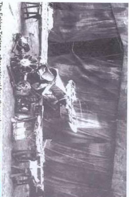
The Fokker Triplane, after retrieval from the crash scene.