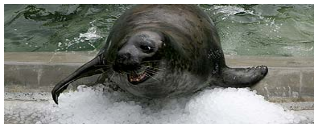
An Arctic seal who doesn't like the cold is receiving therapy for his condition at a sanctuary in Cornwall.