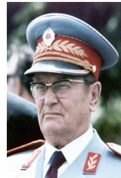
JOSIP BROZ TITO