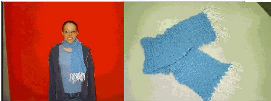
This is me wearing my art project

Yarn: Yarns come in all different kinds and textures. You can get wool, silk, cotton, and synthetics like acrylic. You will also need patterns and knitting accessories are available in craft stores.