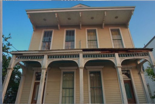
double gallery houses