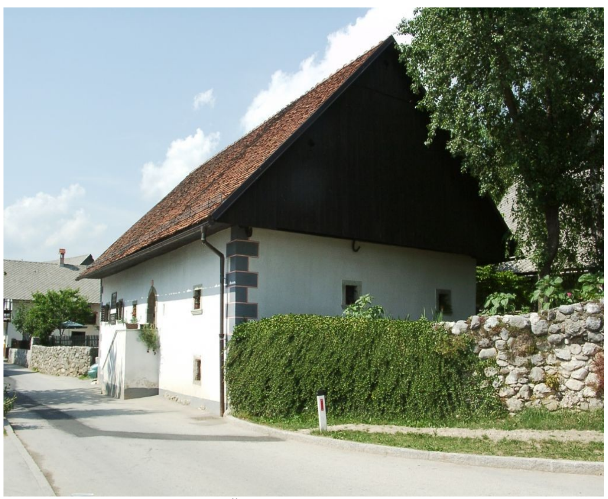
The house where France Prešeren was born.