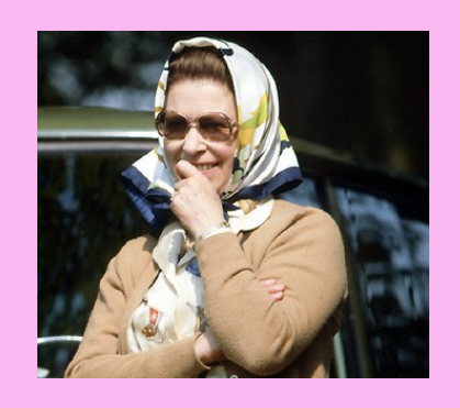
Her Majesty Queen Elizabeth II Queen of the United Kingdom