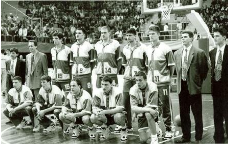
European Cup winners 1994