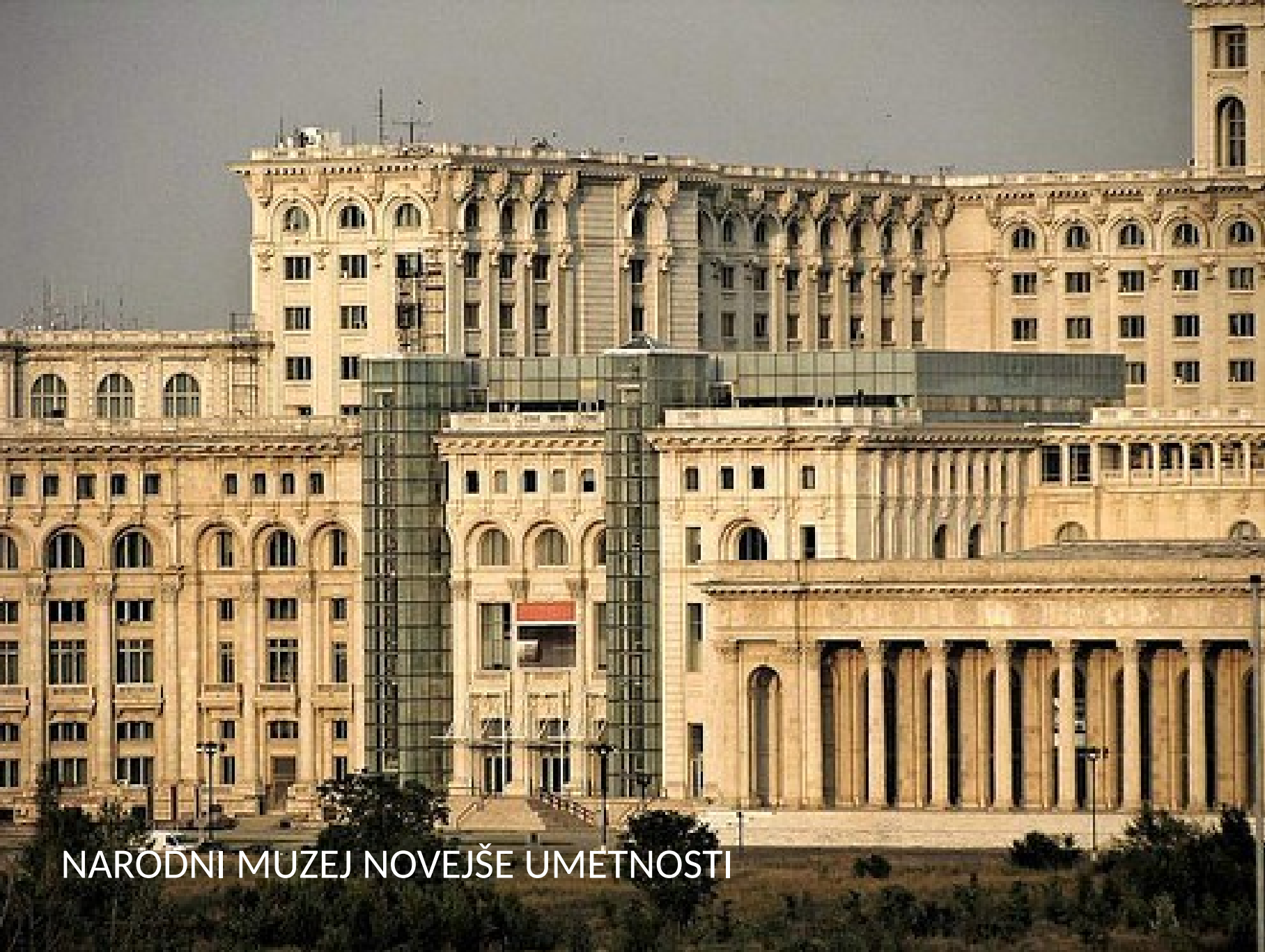
NARODNI MUZEJ NOVEJŠE UMETNOSTI